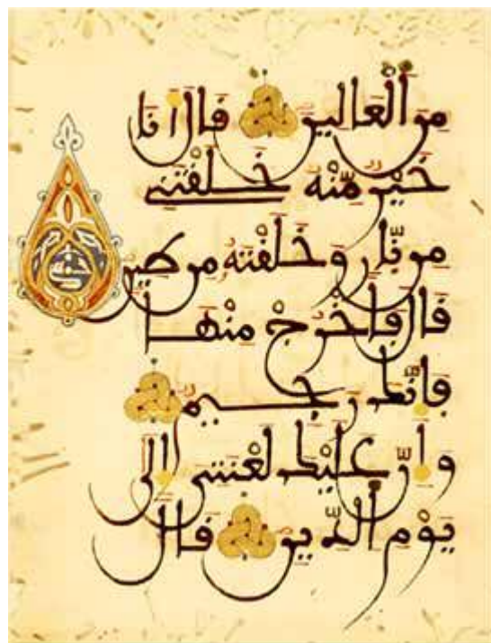
An early manuscript of the Qur'an.

Do they not look at the sky above them? How We have made it and adorned it, and there are no flaws in it? And the earth- We have spread it out, and set thereon mountains standing firm, and produced therein every kind of beautiful growth (in pairs)-To be observed and commemorated by every devotee turning (to God). (Qur'an, 50: 6-8)