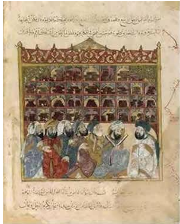
Muslim scholars in Baghdat, the world's scientific capital of the time.

Great centers of religious learning were also centers of knowledge and scientific development. Such formal centers began during the Abbasid period (750-1258 A.D.) when thousands of mosque schools were established. In the tenth century Baghdad had some 300 schools. Alexandria in the fourteenth century had 12,000 students. It was in the tenth century that the formal concept of the Madrassah (school) was developed in Baghdad. The Madrassah had a curriculum and full-time and part-time teachers, many of whom were women. Rich and poor alike received free education. From there Maktabat (libraries) were developed and foreign books acquired. The two most famous are Bait al-Hikmah in Baghdad (ca. 820) and Dar al-Ilm in Cairo (ca. 998). Universities such as Al-Azhar (969 A.D.) were also established long before those in Europe. The Islamic world created the first universities - and even hospitals - in the world.