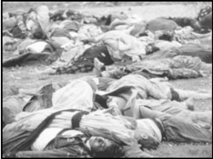
Turkomans that have been subject to genocide by the Saddam government.

living in those lands, nor, of course, of all the other communities. Ensuring the security of our Turkmen brothers , who have been ignored by the foreign powers for some 90 years and whom Iraqi administrations have attempted to assimilate is a moral responsibility for Turkey, the heir to an empire that ruled the region for hundreds of years.