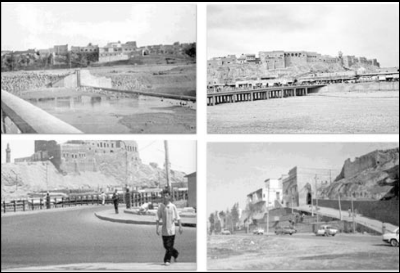
As well as being a settling area, the city of Kirkuk is a symbol for its dwellers. In the pictures various images from Kirkuk are seen.

□ However, Turkey cannot ignore the sufferings and difficulties of its relatives