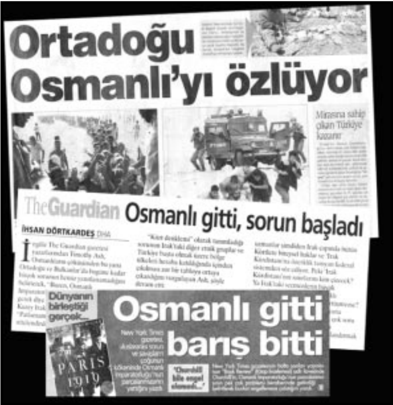
“The Middle East yearns for the Ottomans”. “The Ottomans have gone, the trouble has begun.” “The Ottomans have gone and the peace has ended.”

□ It is essential for common factors between states to be well evaluated in order for this union to be brought about; language is one such factor. The establishment of a linguistic union based on Turkish between the Turkic republics will weld them together. Steps in the direction of linguistic union will make a great contribution to the objective of a Turkish-Islamic Union. In our view, linguistic union among the Turkic states must be based on the “Turkish of Turkey.”