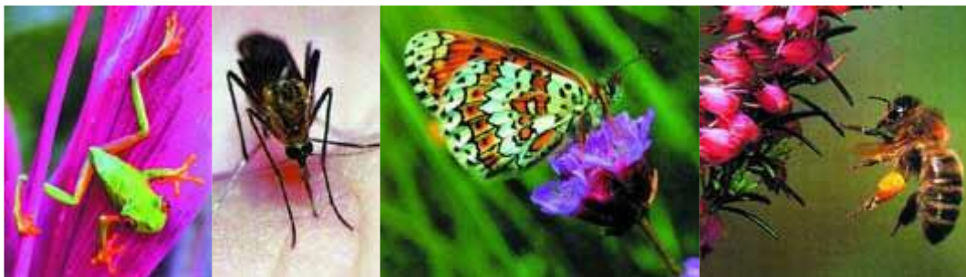
Some creatures that undergo metamorphosis: the frog, the butterfly, the bee, the mosquito.