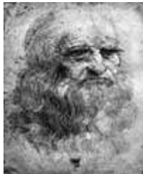
Leonardo Da Vinci