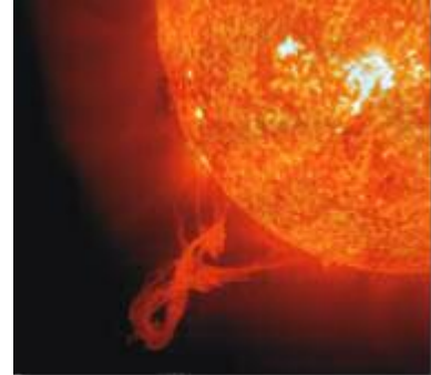
A HUGE BALL OF FIRE Immense twisting solar eruptions are filled with ionised helium gas at a temperature of 60,000 degrees Centigrade. (As observed by the SOHO satellite in extreme ultraviolet light.)

The findings made towards the end of the 20 th century help us to understand the wisdom of Surat ar-Ra'd 41, and Surat al-Anbiya' 44.