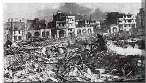
British, French and Israelis move on Suez Canal

On October 26, 1956, Israel attacked Egypt and began to occupy the Sinai Peninsula. The fighting ended shortly afterwards following intervention by the United Nations.