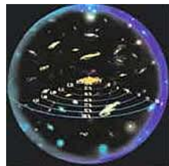
From the moment of the Big Bang, the universe has been constantly expanding at a great speed. Scientists compare the expanding universe to the surface of a balloon that is inflated.

(For further reference, please see, Miracles of the Qur'an , by Harun Yahya)