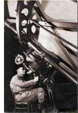
Edwin Hubble with his giant telescope

The word "heaven," as stated in the verse above, is used in various places in the Qur'an. It is referring to space and the wider universe. Here again, the word is used with this meaning, stating that the universe "expands." The Arabic word "moosiaaona" in the term "inna lamoosiaaona," translated into English as "it is We Who are steadily expanding it" , comes from the verb "evsea," meaning "to expand." The prefix "la" emphasises the following name or title and adds a sense of "to a great extent." This expression therefore means "We expand the sky or the universe to a great extent." This is the very conclusion that science has reached today. 1