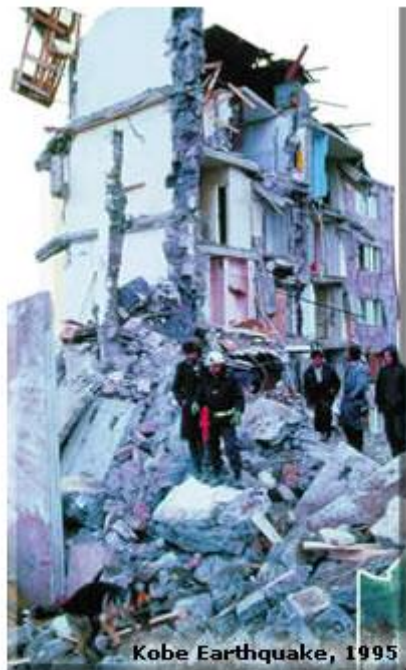
Kobe Earthquake, 1995 The hadiths of the Prophet (saas) mention that most of the earthquakes will increase in the End Times. The frequent occurrence of earthquakes over the last few years is among the foremost concerns

Great cities will be ruined and it will be as if they had not existed the day before. (Al-Muttaqi al-Hindi, Al-Burhan fi Alamat al-Mahdi Akhir al-Zaman)