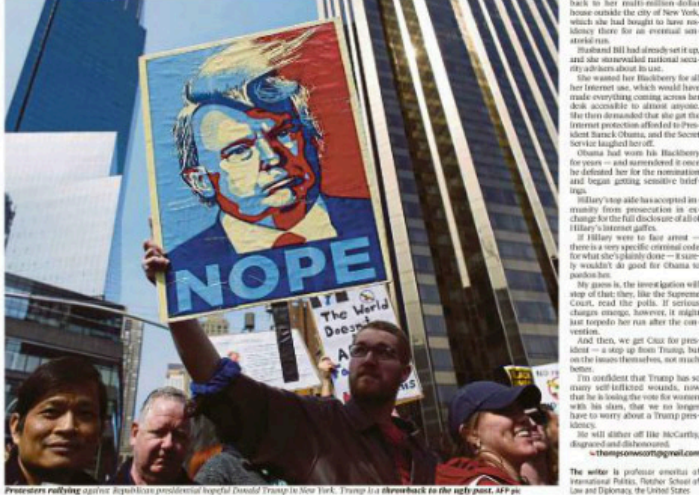
Protesters rallying against Republican presidential hopeful Donald Trump in New York. Trump is a throwback to the ugly past.