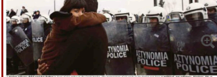
A Syrian refugee child and her father in front of riot police in the Greek town. The performance of our world in the Syrian war has a political, not religious, ideology. USA 14.