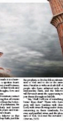
The prophet, who is the like a reflection of God and so on in the same way, the signs of Allah are everywhere, but they are not seen by those who are heedless of anything you do. They are seen by those who are guided to them by Allah's messenger, Muhammad (peace be upon him).

There are thousands of details in human life. From the moment one wakes up till the moment one goes to bed at night, numerous different images flash before their eyes. Just like the deniers, the believers too wake up to find hundreds of tasks waiting to be done. Everyday is a new test for the believer.